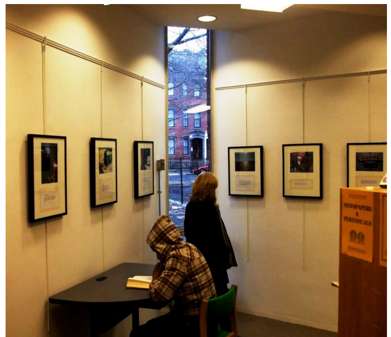
"PhotoVoice exhibit on display at Boston Public Library".